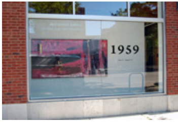
McCormick Gallery, Chicago