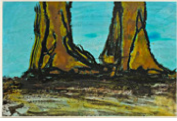
Huma Bhabha at Rhona Hoffman Gallery, Chicago