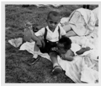
Vivian Maier, New York (Two Children on Blanket) , 1951-55, at Russell

figural sculptures of clay and mud that incorporate the traces of previous live performances.