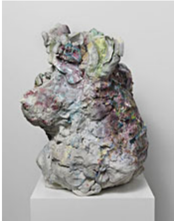
Rebecca Warren, The Republic , 2010, at Donald Young Gallery