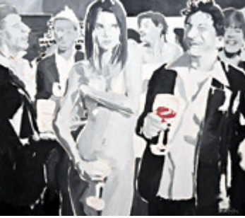
Kevin Berlin, The Emperor's New Clothes #7 , 2008, at Kasia Kay Art Projects