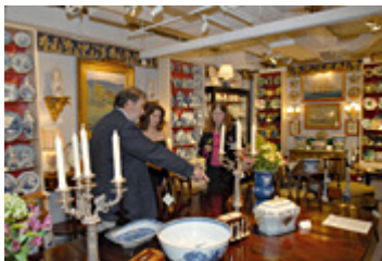
The Merchandise Mart antiques show, 2010