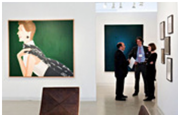
Alex Katz at Art Chicago 2010