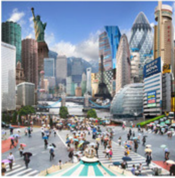
Tom Leighton, Shibuya Umbrella 4 , 2010, at Cynthia Corbett Gallery, London