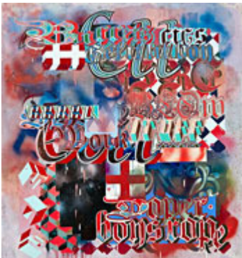
Larry Mullins, Reveille , 2009-11, at Blythe Projects