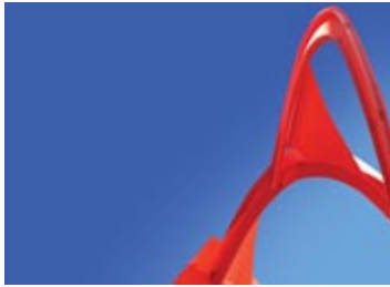
The logo for Art Chicago 2011 (Alexander Calder's Flamingo at Federal Plaza in Chicago)