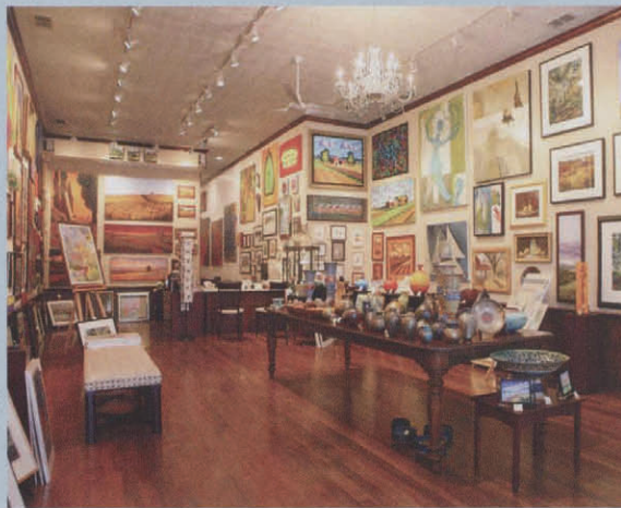
The Leigh Gallery, 3306 North Halsted Street