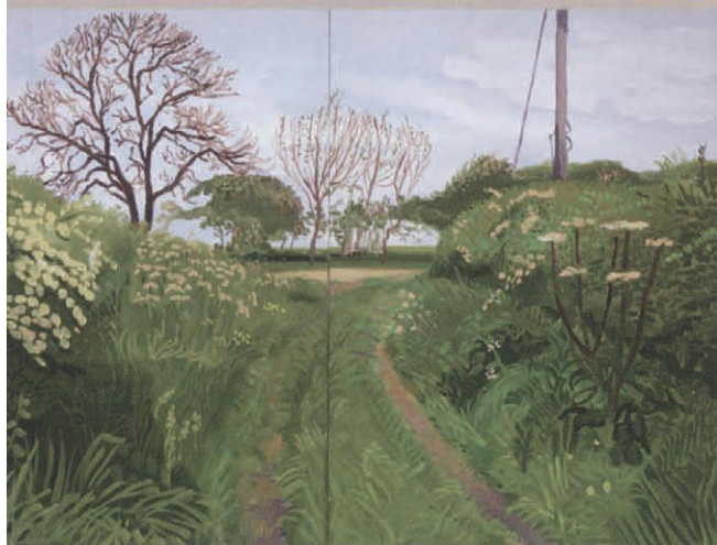
David Hockney, Woldgate Lane to Burton Agnes, 2007, oil on canvas.

Single-day tickets are priced at $20 and multi-day passes are $25: multi-day passes for students and seniors are $15. For additional information please visit www.merchandiseart.com or www.artropolischicago.com .